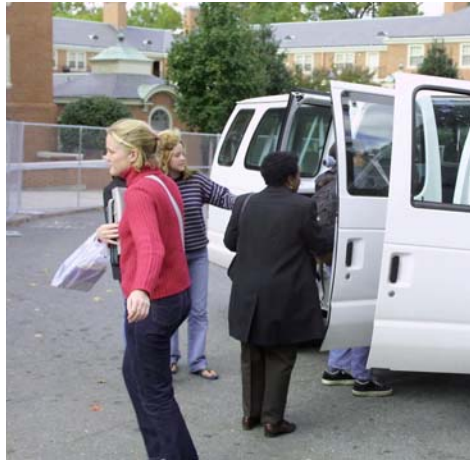
Ride-Sharing Programs (car or vanpooling)